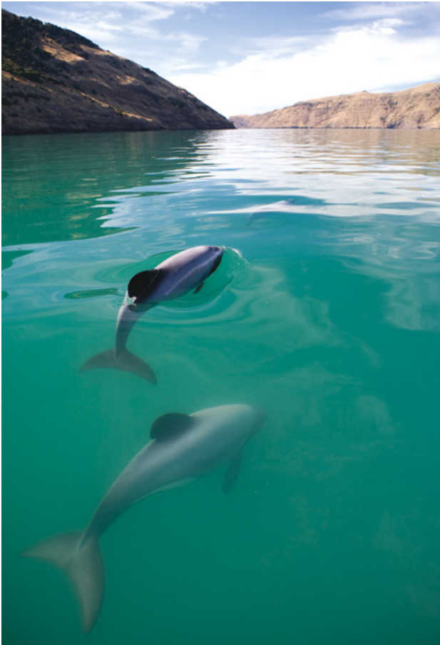
Top The Banks Peninsula on the east coast of New Zealand's South Island.