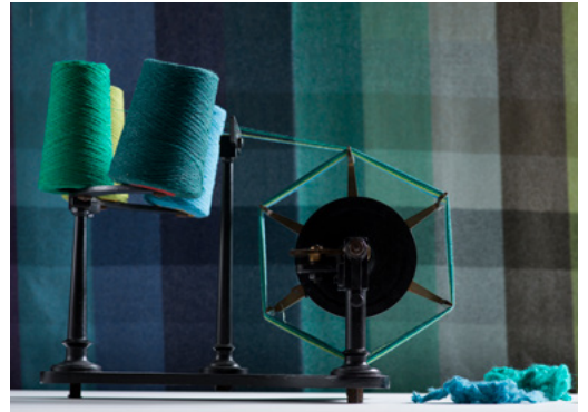
The final 75 shades fought for their place out of 1,200 colours.