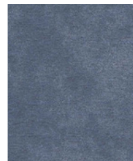
Slate Blue MMT13