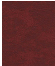
Burgundy Red MMT16