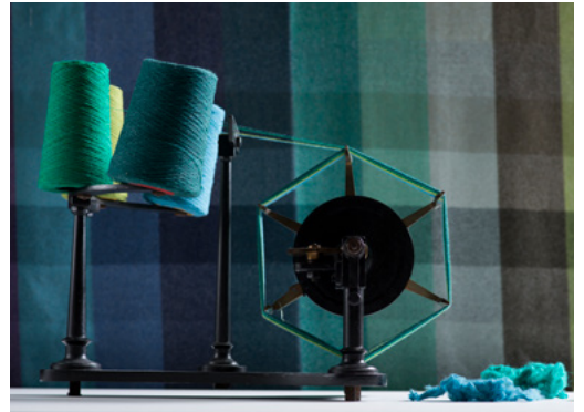
The final 75 shades fought for their place out of 1,200 colors.